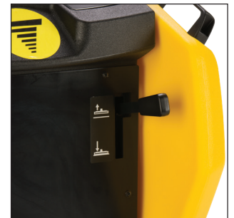
DOUBLE SCRUBBING IS MADE EASY with a lever to raise and lower the squeegee without stopping or exiting the machine.