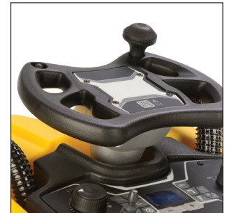
EASY-TURN STEERING WHEEL KNOB allows for one-handed operation.