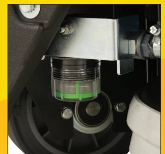
INLINE SOLUTION FILTER prevents clogs and optimizes solution flow.