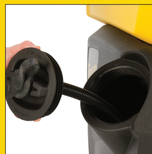
EASY TO FILL TANK with solution fill hose that can be attached to a faucet.