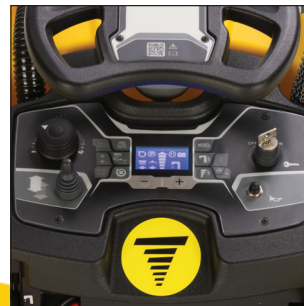
INTUITIVE CONTROLS simplify training and reduce re-work with just a few, easy-to-understand controls.